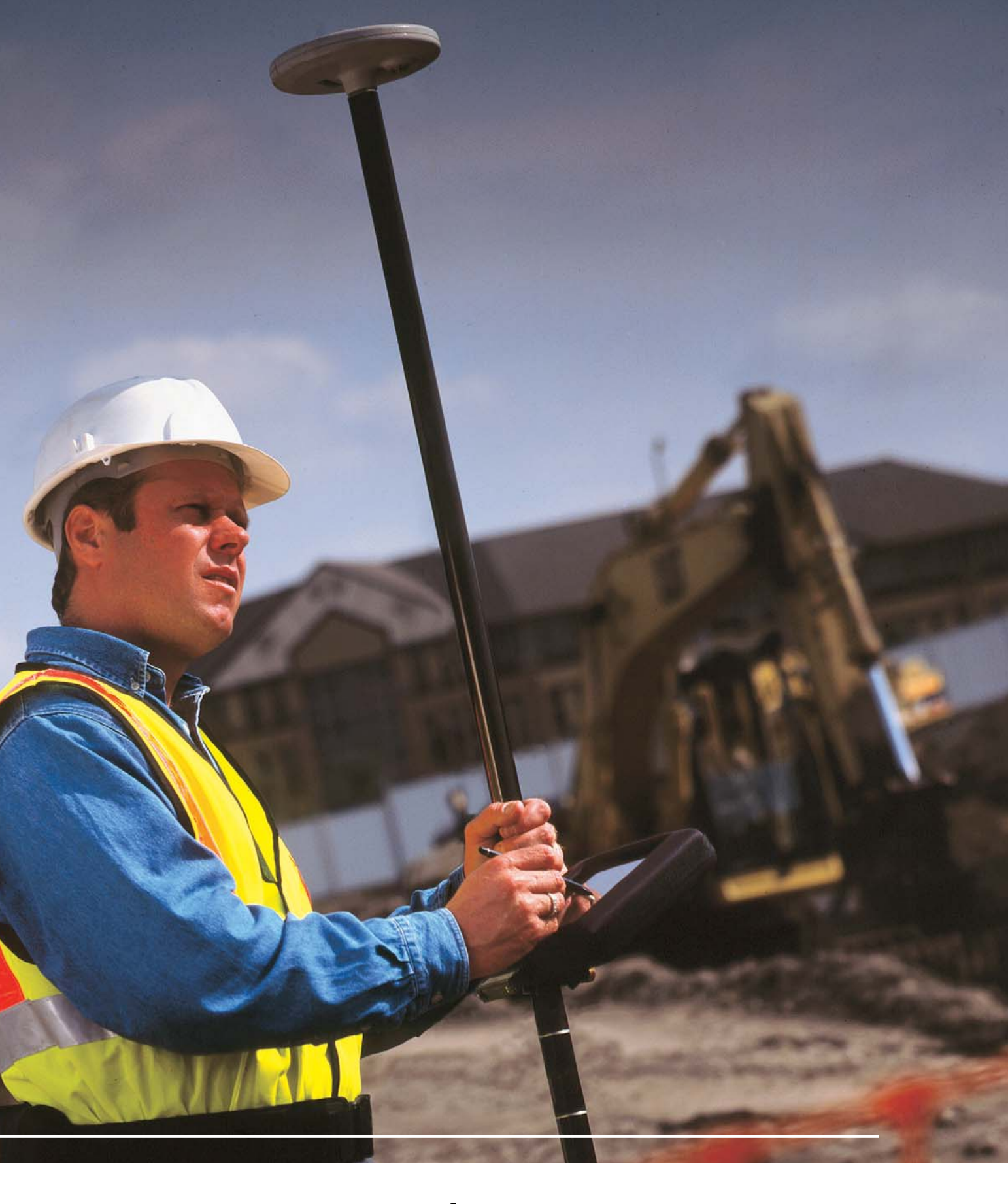
Penmap® — Surveying for Everyone.